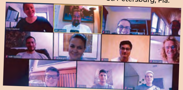
Florida International University in St. Petersburg, Fla.