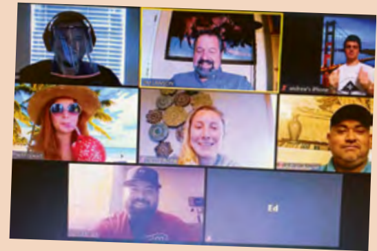
St. Petersburg Community College in St. Petersburg, Fla.

O&P assistant, technician, fitter and practitioner students.