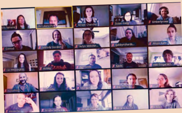
University of Washington in Seattle