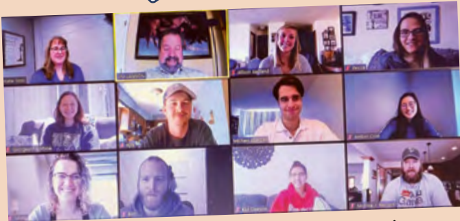
Century College in Vadnais Heights, Minn.