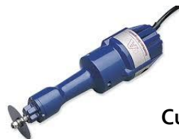
Cut Off Surgical Tube